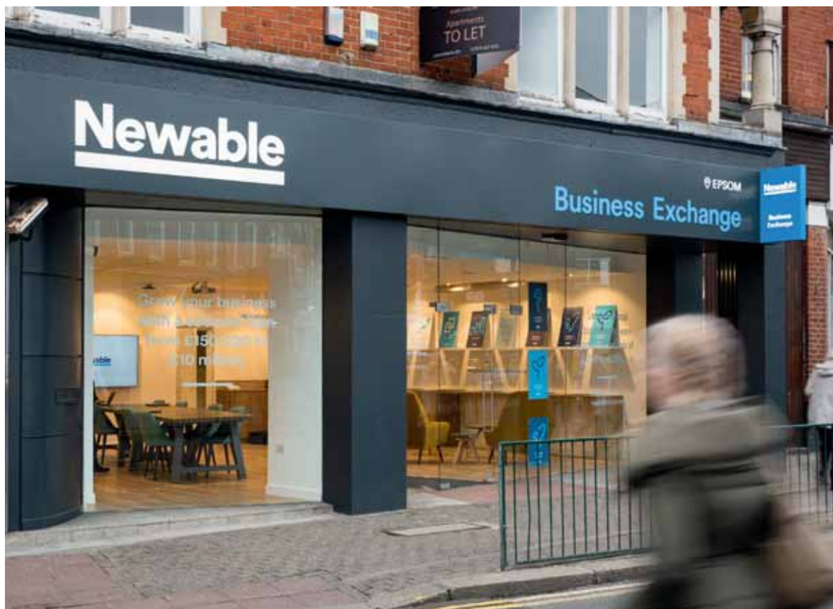
Newable opened our first Business Exchange in Epsom to supporting local business growth

Our ambition this year is to continue to increase the scale of our lending business. This will be through the continued growth of Newable Business Finance, entering the commercial finance broking market (see note 31) and launching new lending products to support UK small businesses in their growth.