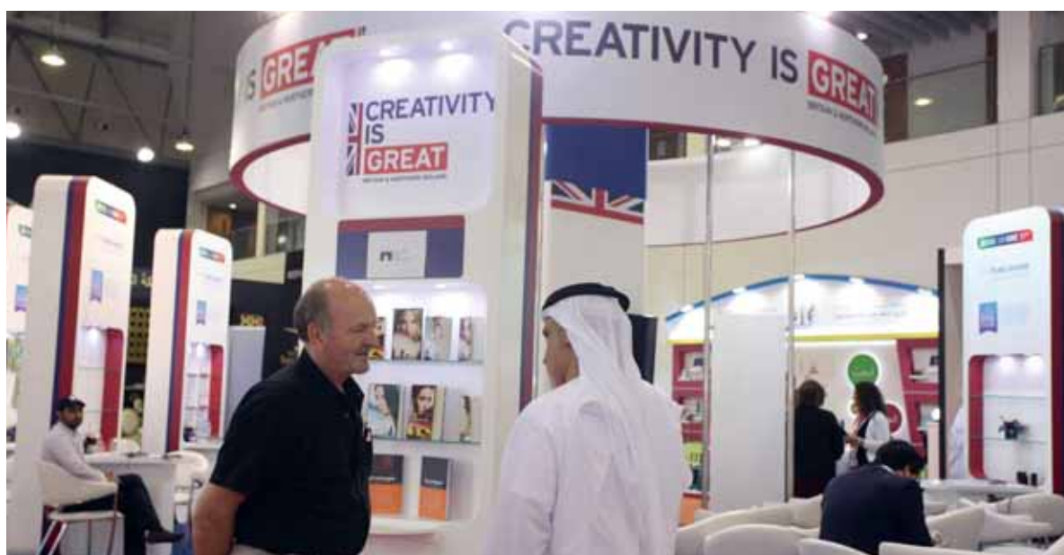
Newable's Department for International Trade Team curated the UK's presence at The Sharjah Book Fair promoting independent publishers from London.