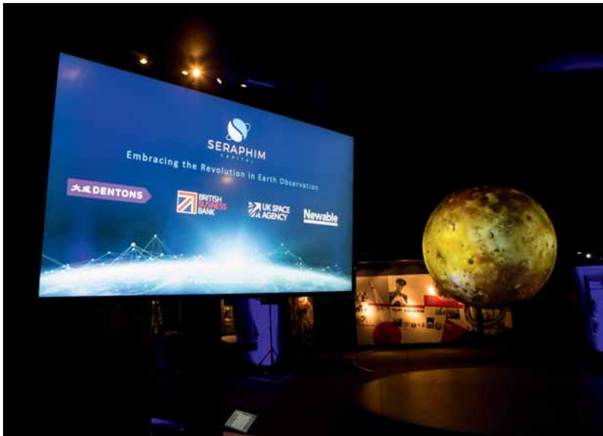
Newable's Events team launched the Seraphim Space Fund with a VIP event at the Science Museum

During the year Newable engaged with over 1,100 companies (approximately 290 intensively) to deliver its innovation, access to funding, internationalisation and training support services. 91 London SMEs have been supported to secure international partnership agreements and grant funding for research and development, to progress and exploit the commercial and global potential of their innovations. In addition, the team helped to secure over £5m funding and finance for young businesses.