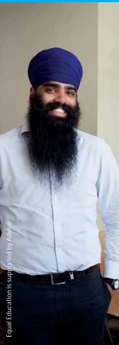
Equal Education is supported by Advice