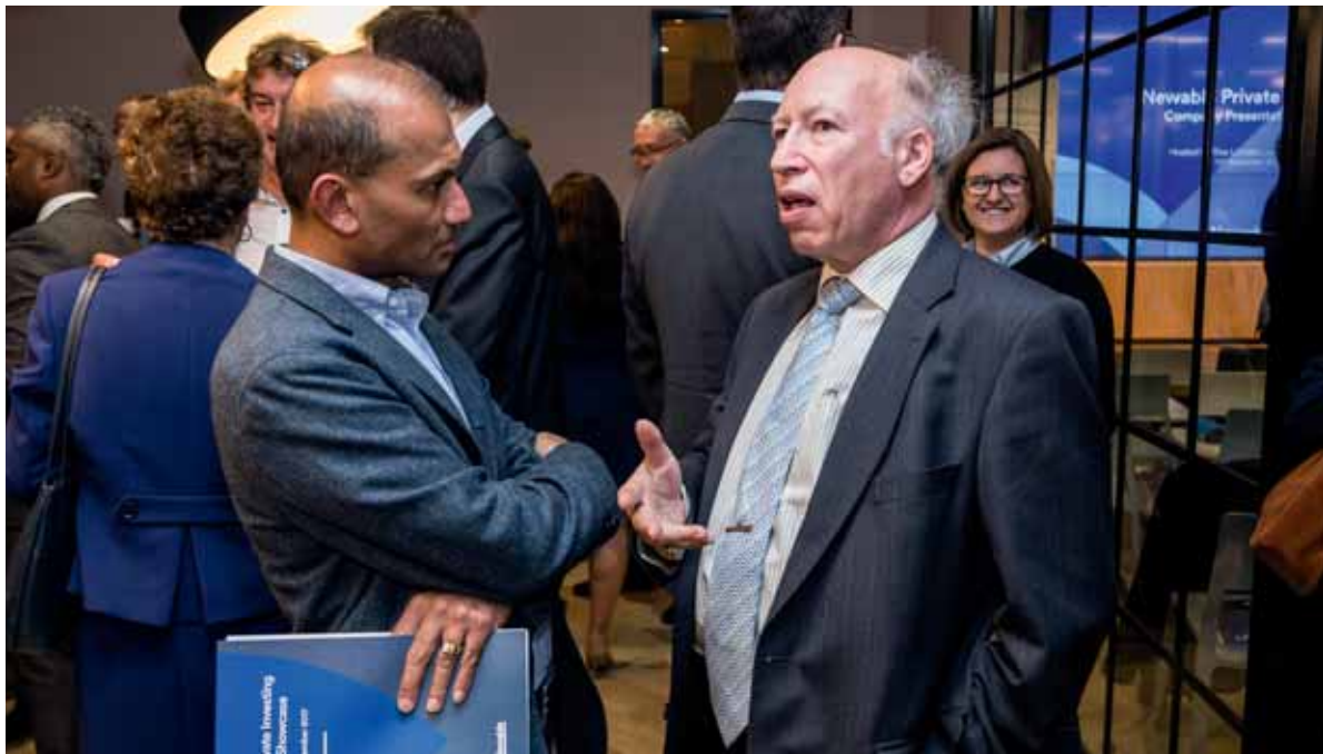
Newable Private Investing showcased over 70 companies to EIS 'angel' Investors

Following its acquisition of London Business Angels in April 2017, Newable has successfully built out an early-stage equity investment footprint across the United Kingdom. In September 2017, LBA was rebranded to Newable Private Investing. Over the period,